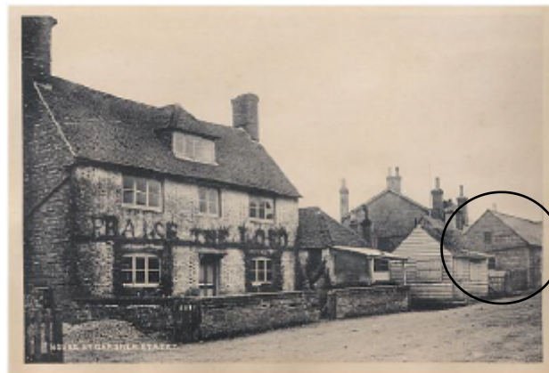
Information Centre (circled) c.1905

The Centre is dependent upon grants from other charities and donations from concerned individuals in order to keep it running.